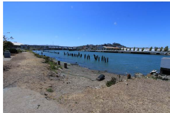
A gentle unpaved path to the gravel beach provides the most used water entry to Islais Creek.

Other Launch/Landing Notes: A well worn dirt path runs from the main paved walkway down to a sandy beach. The beach substrate is hard sand/small gravel leading to rocky mud. This launch is most often used by Kayaks Unlimited members and Dragon Boat Training Center teams.