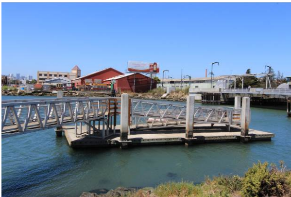
The gangway provides accessible access to the high freeboard dock.

Gangway Slope Description: Slope is gentle, but the gangway contains a 90 degree and a 180 degree turn that can make use difficult when carrying equipment.