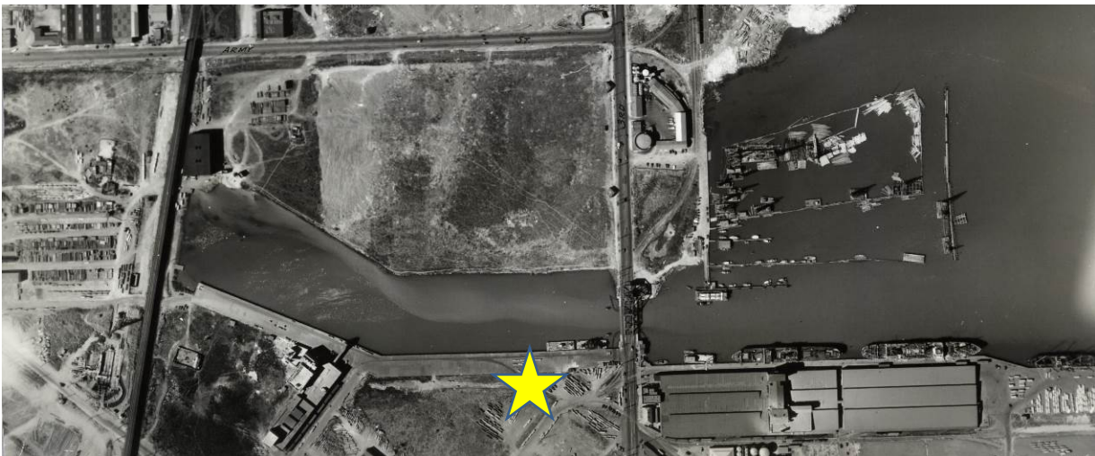
Islais Creek has a long history of use – from villages along the historic estuary, to the center of San Francisco’s meat packing industry, to military and industrial shipping. Photo: 1938